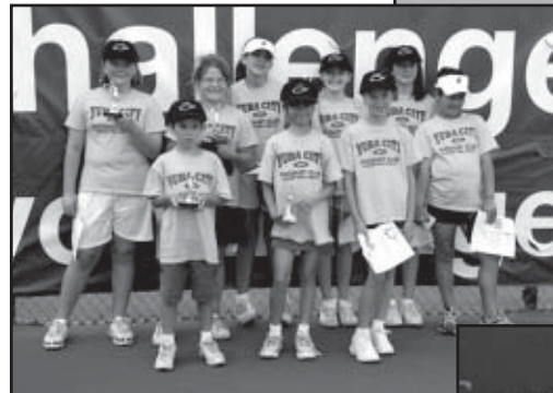
2005 Junior Pro Circuit Champions celebrate at the Challenger.