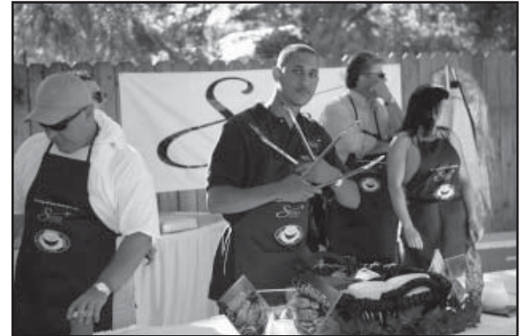
Taste of Yuba-Sutter.